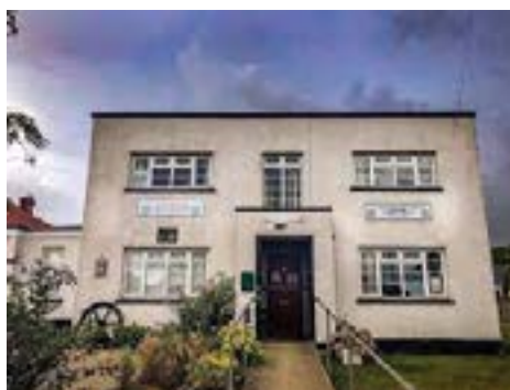
AYLESHAM PARISH COUNCIL

to keep recreational areas and the rest of the village clear of waste: and somewhere to deposit dog poo. This department also regularly inspects coasts, rivers and trees to keep the environment in good condition.