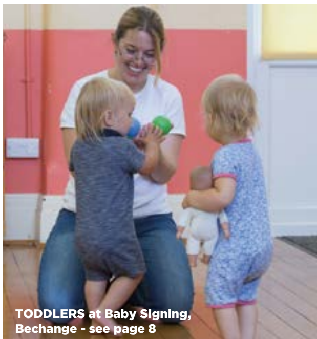
TODDLERS at Baby Signing, Bechange - see page 8