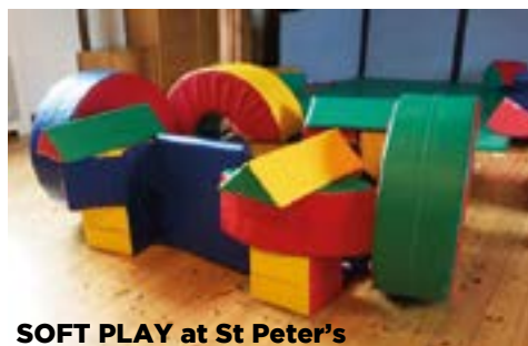
SOFT PLAY at St Peter's

We wanted to find a way to support our families in being the best parents they can be. So we work with Bechange to provide a space to discuss topical parenting issues