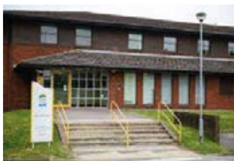
DOVER DISTRICT COUNCIL Whitfield