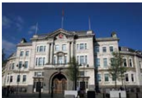
KENT COUNTY COUNCIL Maidstone

DDC is responsible for most leisure and recreation across the district. In Aylesham, DDC maintain a number of the play parks (by the doctors and on the green in the new builds) and has an obligation to provide outside space for residents. In addition to this, as part of its environmental health department, DDC provides waste bins