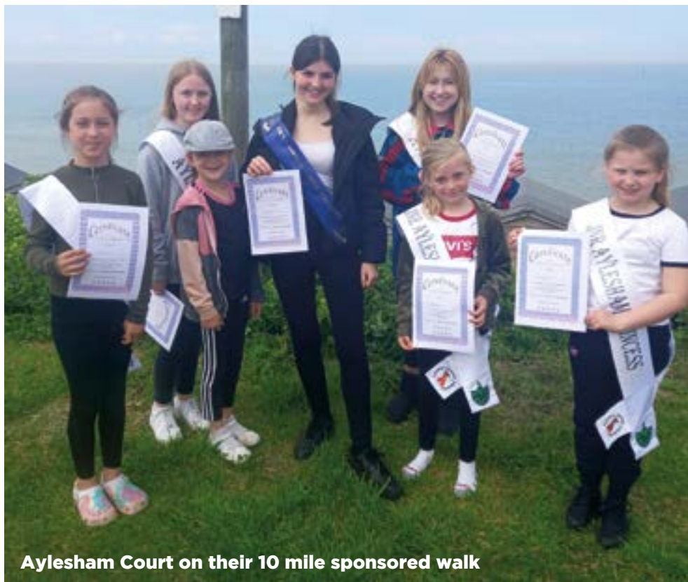
Aylesham Court on their 10 mile sponsored walk