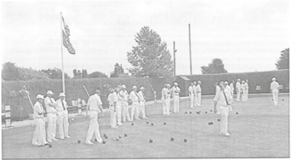
Flags Flying: the England Bowls Club and the Aylesham & Snowdown Welfare Bowls Club flags overlooking the friendly match.

The bowls club is currently welcoming new members