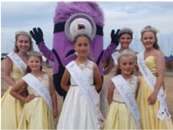
CARNIVAL CAUGHT! photo-bombed by a Minion