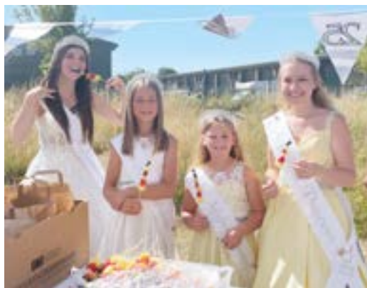
CARNIVAL ROYALTY try an ASPIRE fruit kebab

The ASPIRE project provided healthy food including fruit kebabs, and adults and children had fun making healthy drinks on the smoothy bike.