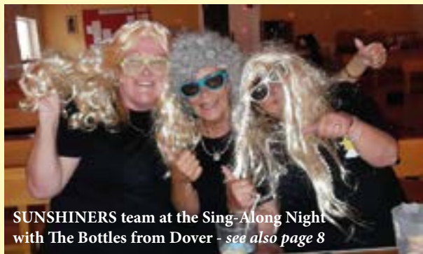
SUNSHINERS team at the Sing-Along Night with The Bottles from Dover - see also page 8

The sun shone this year and hundreds joined in the fun. A4A are seeking volunteers to join the team. Contact them via Facebook.